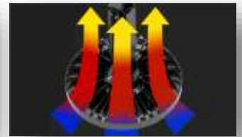
Better Heat Dissipation