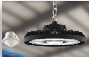
Integrated Motion Sensor Available