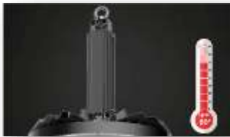
65°C Applications Available