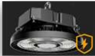
Emergency Backup Solution